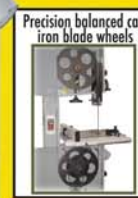
Precision balanced cast iron blade wheels

SIZE: 1/4" - 3/8" -1/2" -3/4" - 1" $26 $29