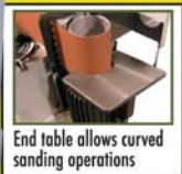
End table allows curved sanding operations